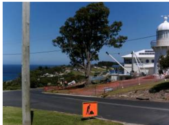
22 nd November 2010 sees the start of work on the Cavalcade of History.