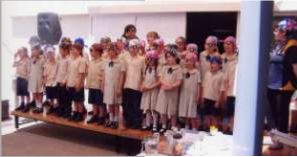
Below: St. Joseph's School Choir