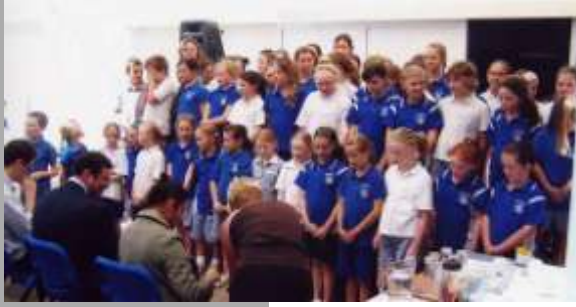
Above: Eden Primary School Choir