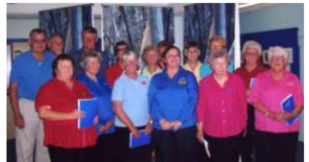
Top: Seniors Citizens Luncheon. Above: Sing Australia Choir