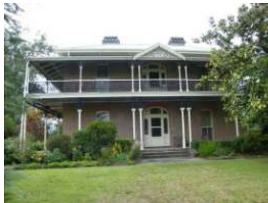
Above: "Daisybank" Homestead built 1870