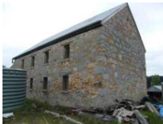
Below: Bacon Factory near the dairy at "Daisybank"