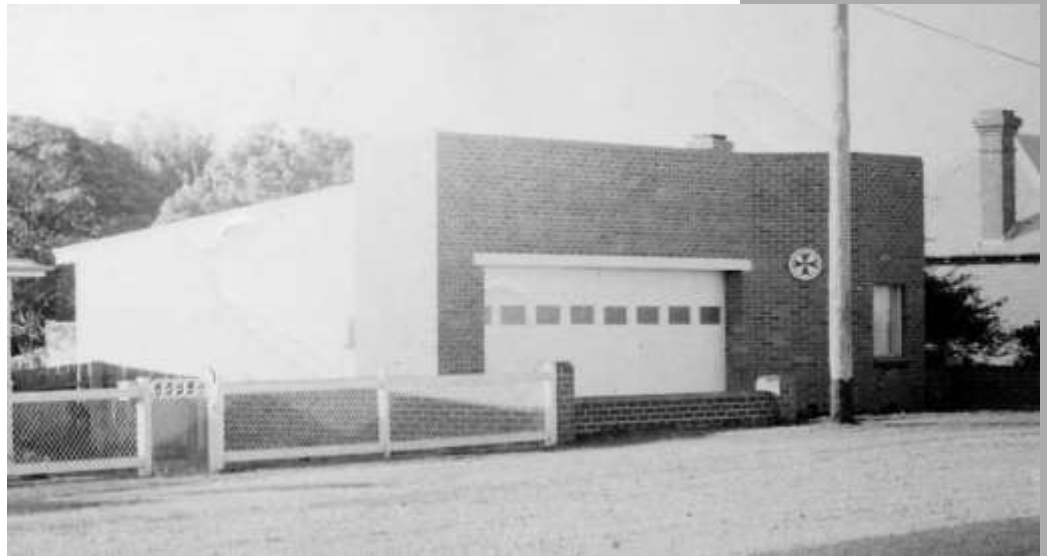
Eden Ambulance Station, Bass Street in its original form.

After the sale of the 1956 Bedford we were loaned a Valiant Ambulance by the Narooma Station, we then ordered a Holden Panel Van, converted by Grices in Sydney, as the workload was increasing & it became necessary to have two ambulances at the Station. This situation was increased to 3 ambulances and 3 Officers by about the mid 1970's. The fleet then consisted of two F100's and